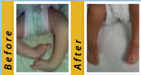
Knee and Foot Disorders Club Feet