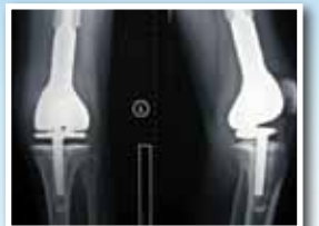
Metallic Prosthesis Tumor Surgery