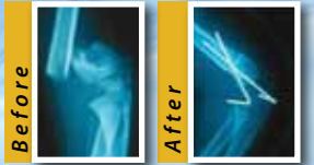
Trauma Fracture (2 Crossed K-Wire Fixation)